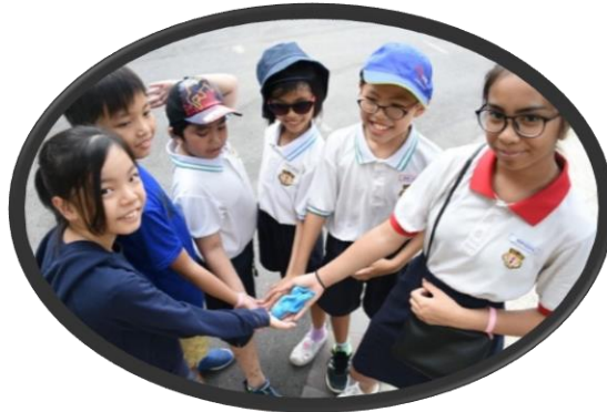
PSG Outing 2019 – Gardens by the Bay