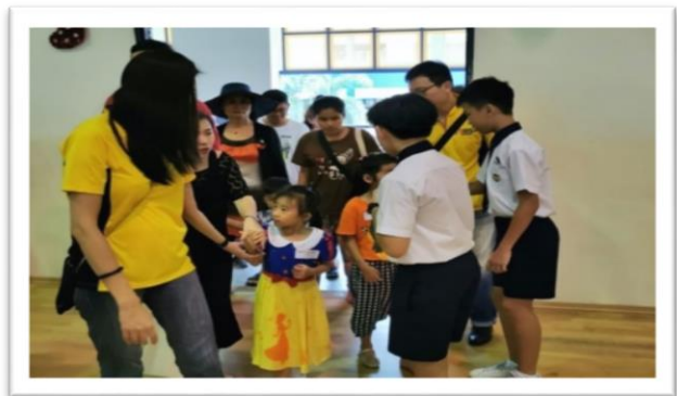
P1 Cohort 2020 Orientation – Great support from PSG