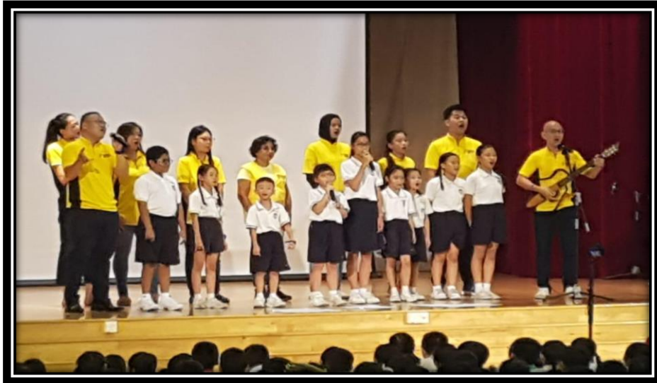
Teachers' Day Concert 2019

During Teachers' Day, our talented PSG members and their children took to the stage to present a song that was specially dedicated to our GMS(P) teachers. This just another one of the many little ways we thank the teachers who work so hard for our children throughout the academic year.